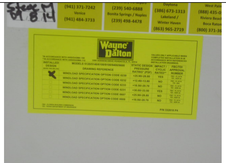
Garage door data