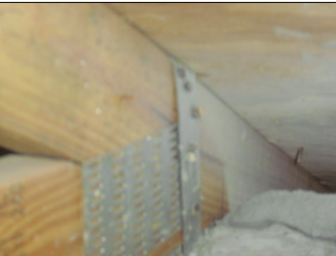
Roof to wall attachment