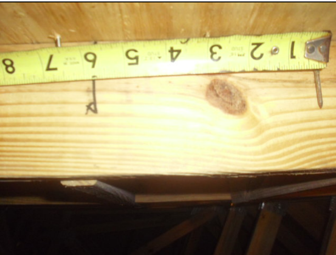
Roof deck attachment