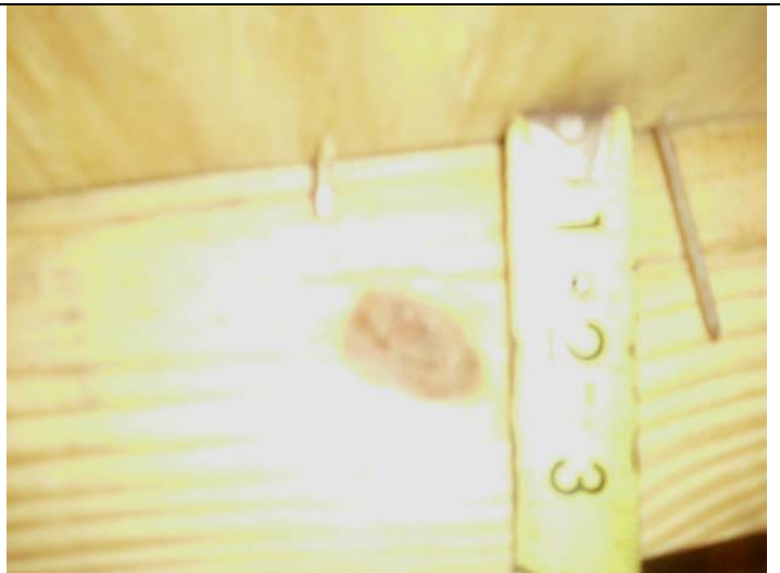
Roof deck attachment