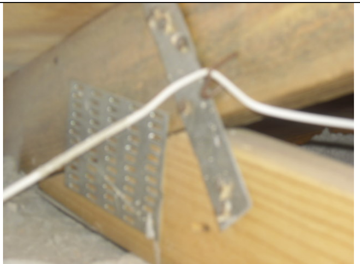
Roof to wall attachment